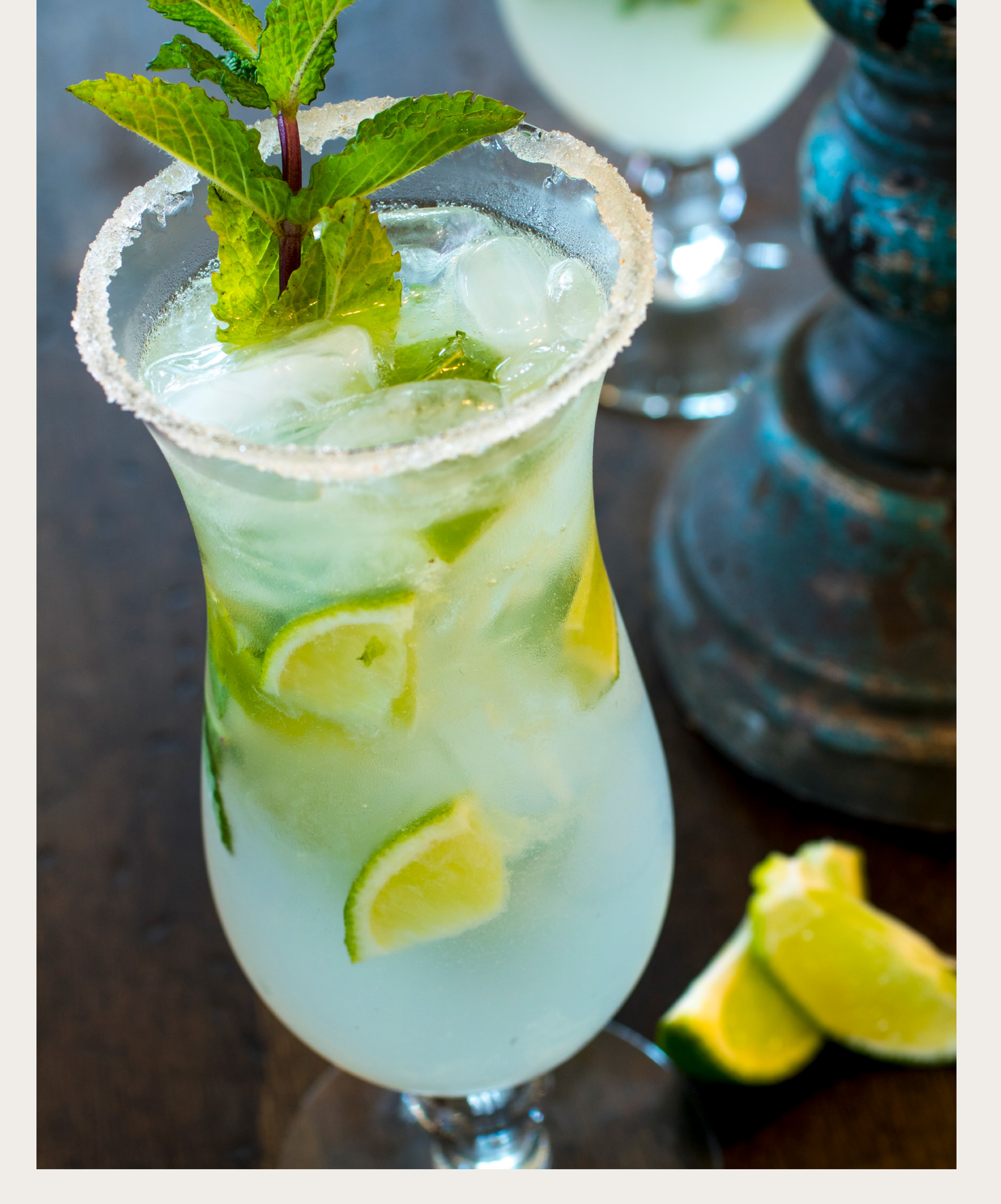
MARRAKESH MINT MOJITO