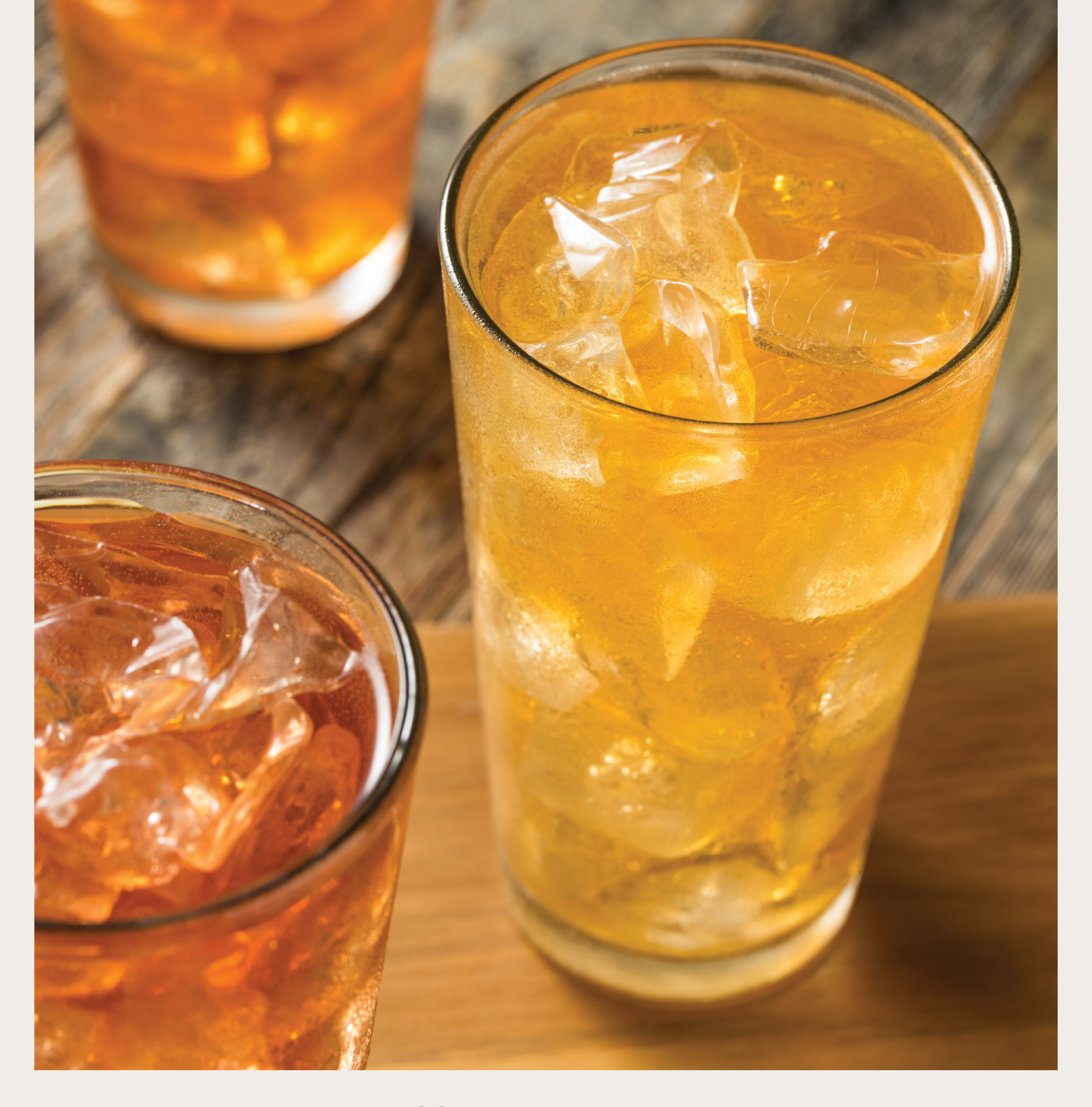
COLD BREW TEA