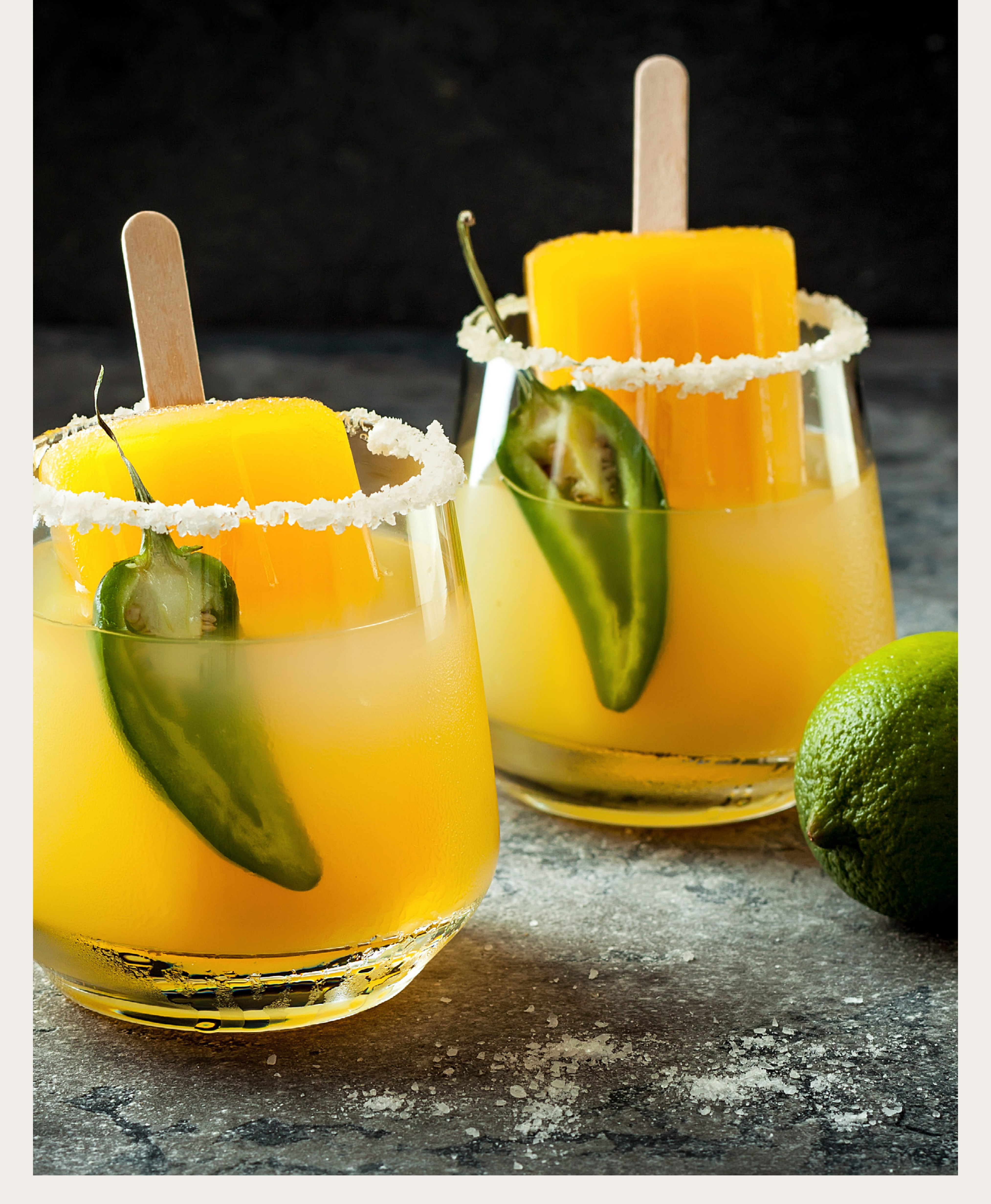
CHILI MANGO POPTAIL

How do you fill an already delicious beverage with more fun and flavor? First, infuse the tequila with herbal tea. Second, swap the ice for a popsicle. But these aren't just any ol' frozen treats – they're little, hand-held cocktails that keep your drink chilled without watering it down. It's like getting two margaritas in one.