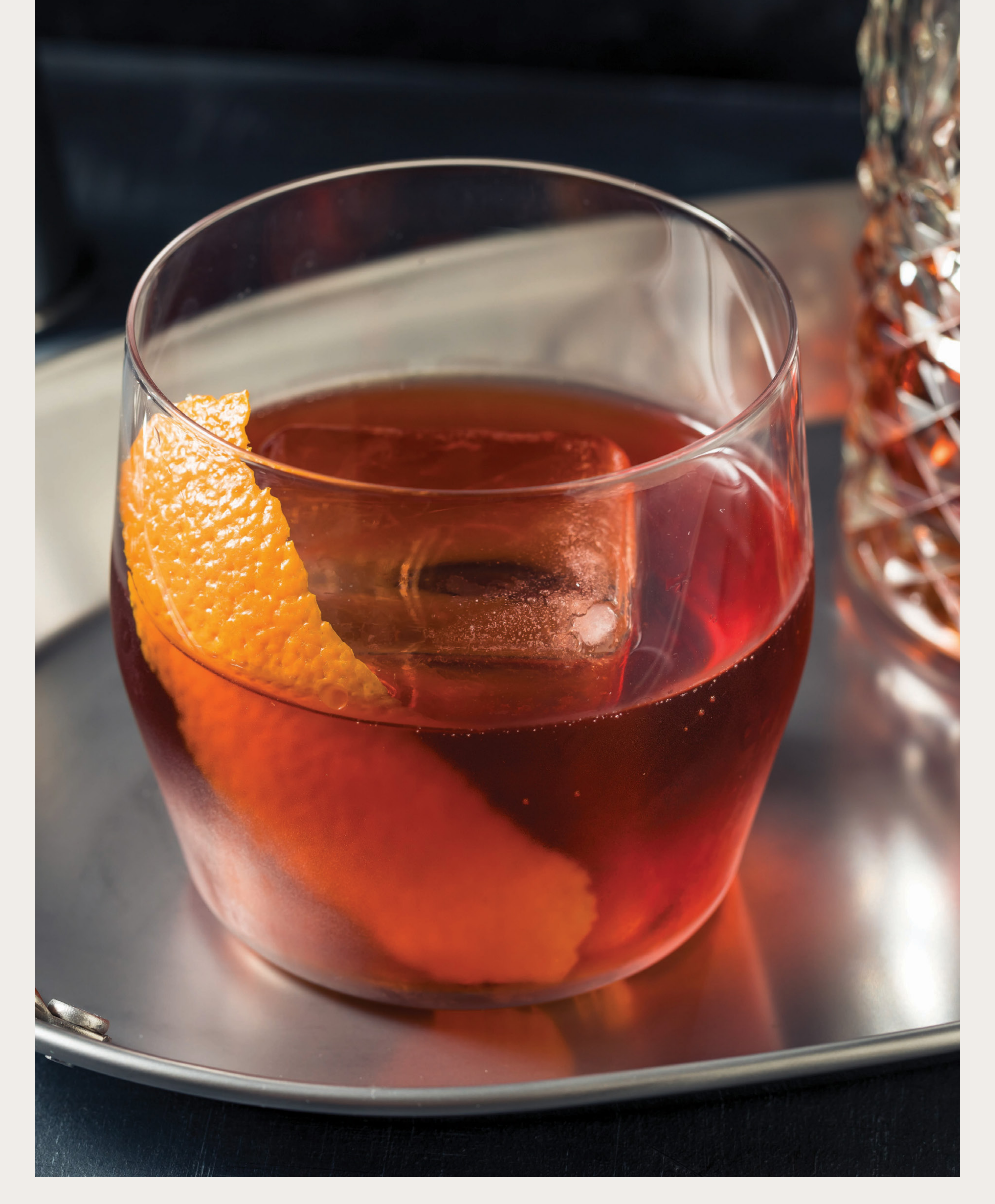
AMARETTO CITRON SIPPER

This bright concoction of rum, amaretto, and orange juice combines the smooth flavors of a Mai Tai with the relaxed sophistication of a sipping cocktail. While the star of this simple beverage is dark rum (infused with Blood Orange Smoothie herbal tea), it's the few drops of salt water that is the unsung hero – a dash or two really unites and brightens flavors.